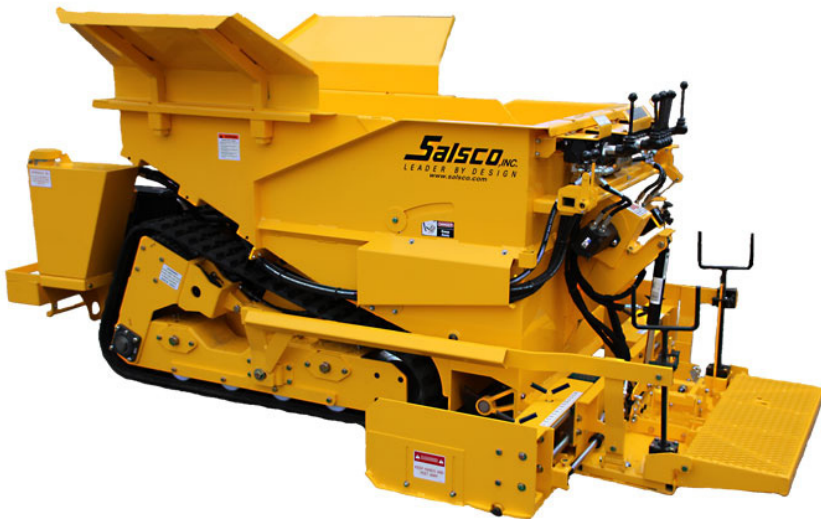
Pictured above the TP44-TD is shown with the 6" Screed Extensions Option, and Loading Panels Option.