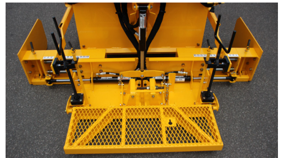
Hydraulic End-Gates move in & out, and have rulers on the top of the end gate to see where they are.