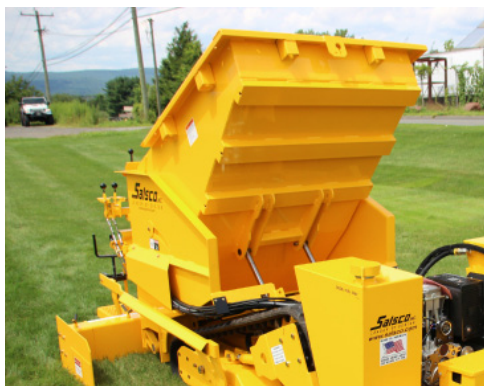
Hydraulic Tilt Hopper. Hopper easily bolts together. Raise the complete hopper for ease of maintenance.

"My Salsco Track Paver is a great little machine. Its durable manufacturing quality & accessibility to parts, make it an efficient machine to use on all my sidewalk & trench jobs. Also, considering the small crew it takes to run, and its overall ease of operation, I know I'm getting maximum productivity whenever it's on the job."