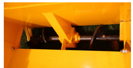
Two (2) 9" Cast Augers are independently operated both Forward & Reverse.