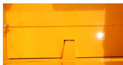
Extra Large Cut Off Door with two (2) Cylinders & Flow Regulators that open the door evenly & smoothly.