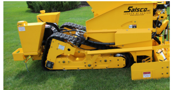
Tracks are fixed at 38" to accommodate screed style.

"My Salsco Track Paver is a great little machine. Its durable manufacturing quality & accessibility to parts, make it an efficient machine to use on all my sidewalk & trench jobs. Also, considering the small crew it takes to run, and its overall ease of operation, I know I'm getting maximum productivity whenever it's on the job."