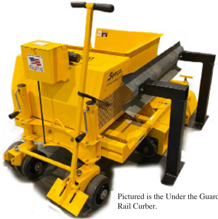
Pictured is the Under the Guard Rail Curber.

Mold housing transfers right to left! Many styles of molds are available as standard (see back side of literature for samples) and special designed molds can be made. Nine wheels offer stability and ease of control. Unit comes standard with a 6" cast auger. Pictured to the left is the Cobra Curber being loaded with the Salsco Side Dump Bucket a perfect companion for ease of loading.