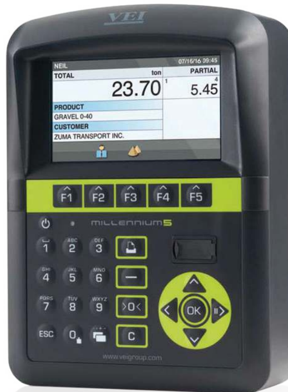
Report sorted by Customer and Product