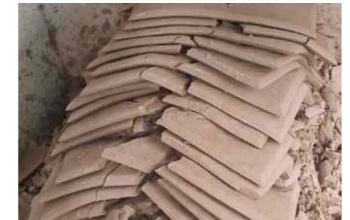
Compressed cakes ready for reuse or disposal