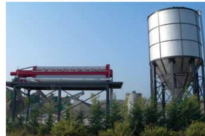
Filterpress and deep cone thickener tank

Matec® is a worldwide leader company in a water treatment and filterpresses and specialises in the design, production and development of waste water purification and filtration plants for many different industries, the most important of which are: aggregates, gravel, sand, stone ceramics, glass. In the last 10 years, Terex Washing Systems and Matec® have successfully installed more than 1000 Washing and Purification plants.